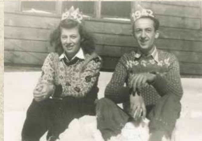
King and Queen at the snowy "College Camp" in Brocton, in 1942.