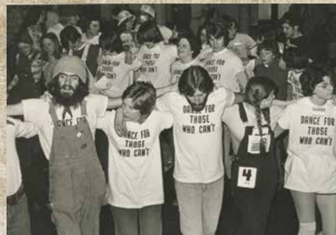
Participants in the dance marathon "Dance for Those Who Can't" in the Williams (Campus) Center to benefit the Muscular Dystrophy Association, circa '70s.

Stay connected with fellow alumni using any of our social media platforms: