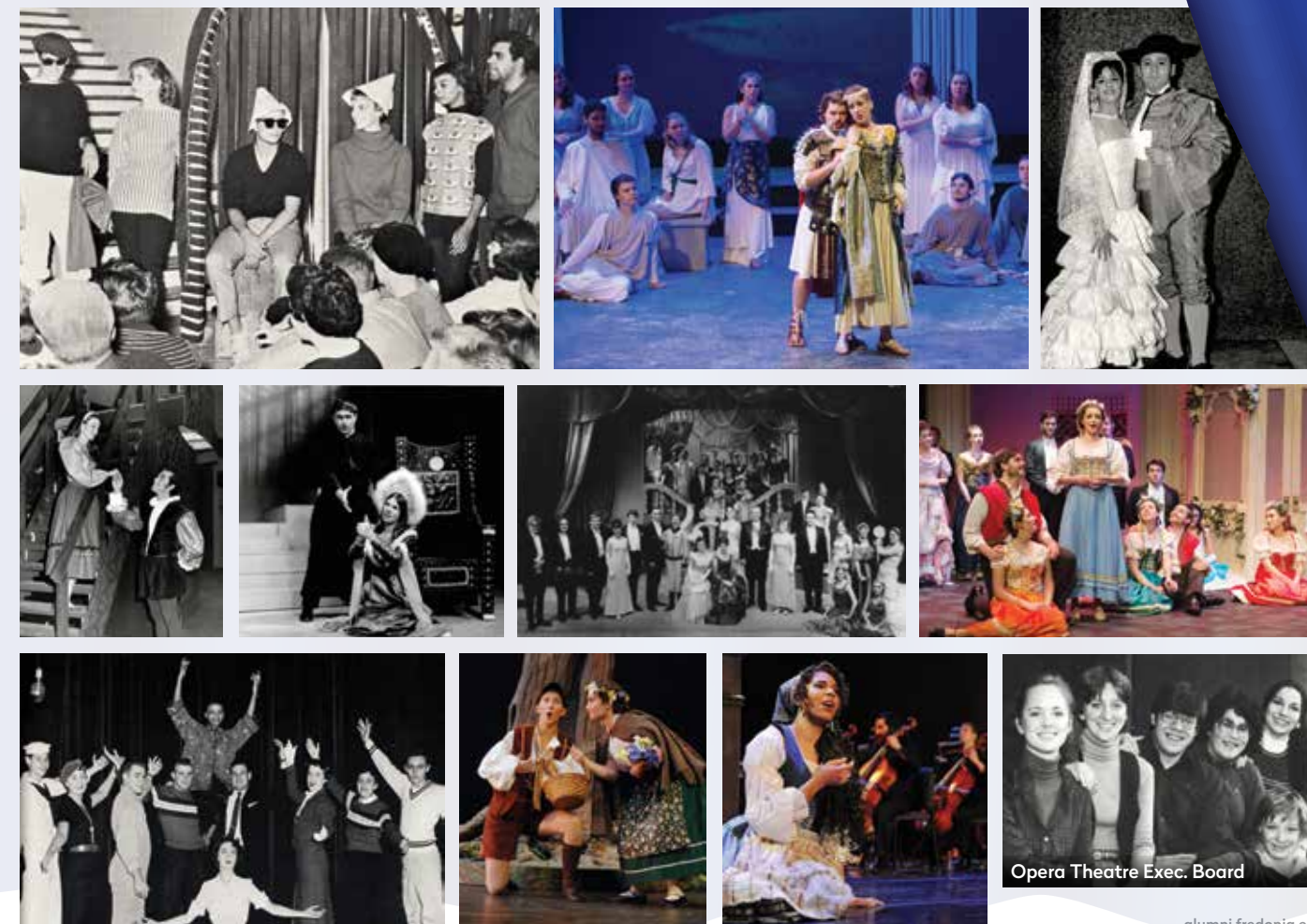
Opera Theatre Exec. Board