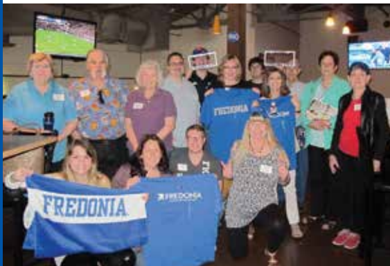
Arizona Alumni Reunion