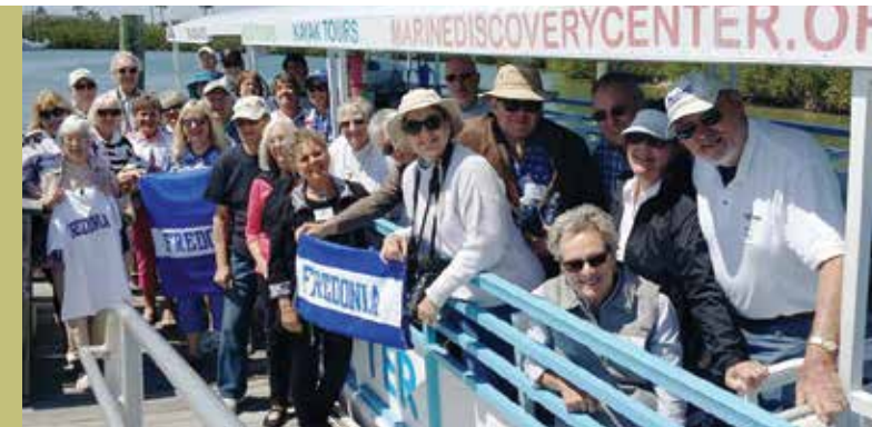
New Smyrna Beach (Fla.) boat excursion, with alumni and emeriti faculty and staff.