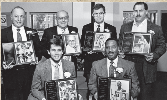
Athletic Hall of Fame Class of 1990