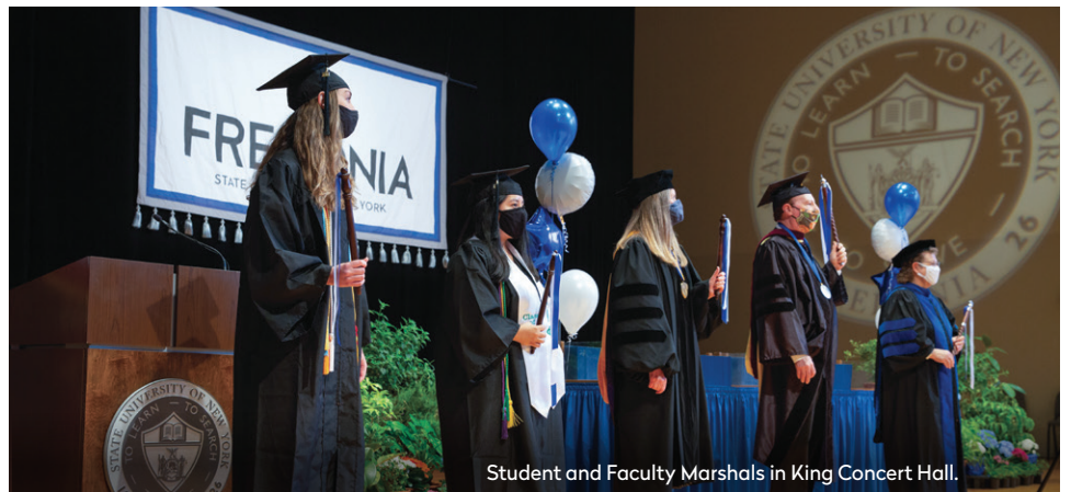
Student and Faculty Marshals in King Concert Hall.