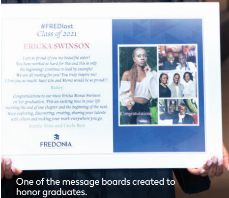
One of the message boards created to honor graduates.