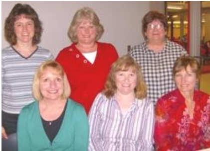
EDP Distinguished Service Recipient—LoGrasso Health Center Some of the Health Center staff.