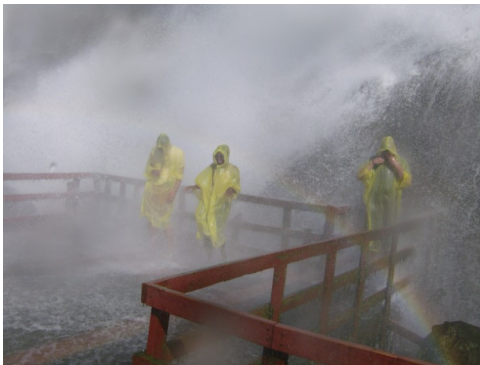
Field trip during EDP's Freshmen August Workshop—Niagara Falls, USA

New freshmen will also participate in the College's Summer Orientation and Advising Program (SOAP). They will choose from one of five two-day sessions where they will have a chance to select their fall classes and attend presentations on topics such as financial aid, the billing process, and on-campus services.