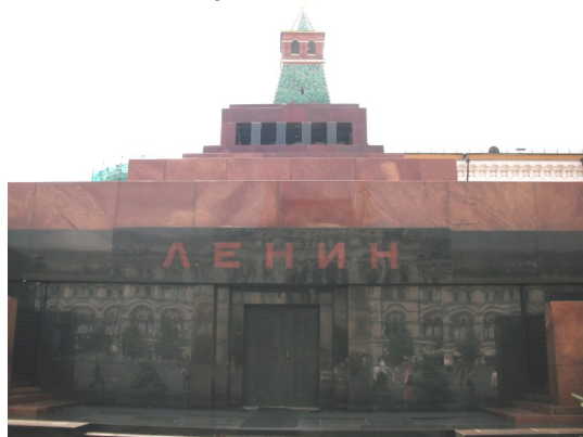
Picture of Lenin's mausoleum.

My three week trip of Russia has forever changed me. I have a much