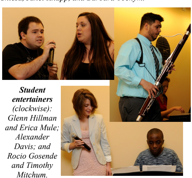
More pictures may be found on EDP's website—www.fredonia.edu/ edp/2012_AwC_30th.asp