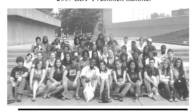
2007 EDP Freshmen Summer

New freshmen will also participate in the College's Summer Orientation and Advising Program (SOAP). They will choose from one of five two-day sessions where they will have a chance to select their fall classes and attend presentations on topics such as financial aid, the billing process, and on-campus services. It is mandatory that new EDP freshmen attend both a SOAP session and the three-day EDP orientation.