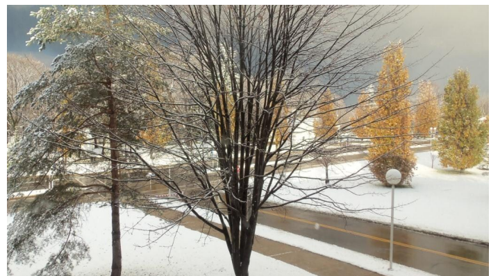
View from EDP’s windows in Thompson Hall. First snowfall on campus—November 17, 2011.