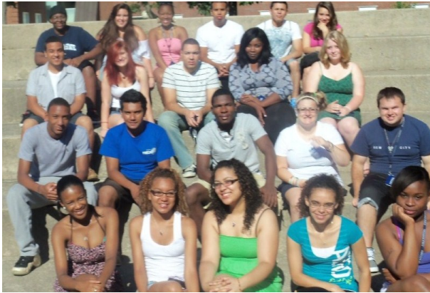
2011 New EDP Students