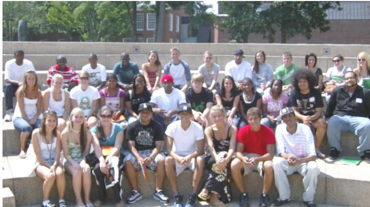
2008 EDP Freshmen Summer Orientation Participants