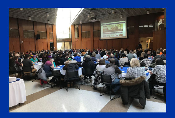
Spring 2018 Orientation