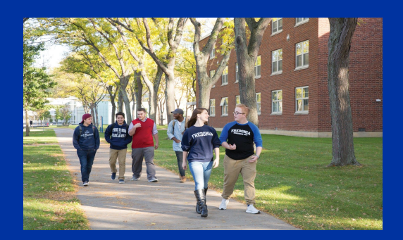
New Fredonia students explore campus

The office had a 96% completion rate of federal verification during 2017-2018.