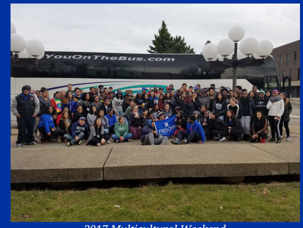
2017 Multicultural Weekend