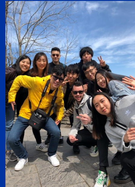
Trip to Niagara Falls State Park