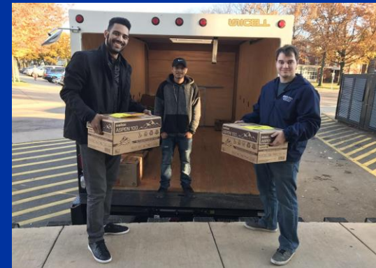
Operation Breakfast Rescue with Kappa Sigma