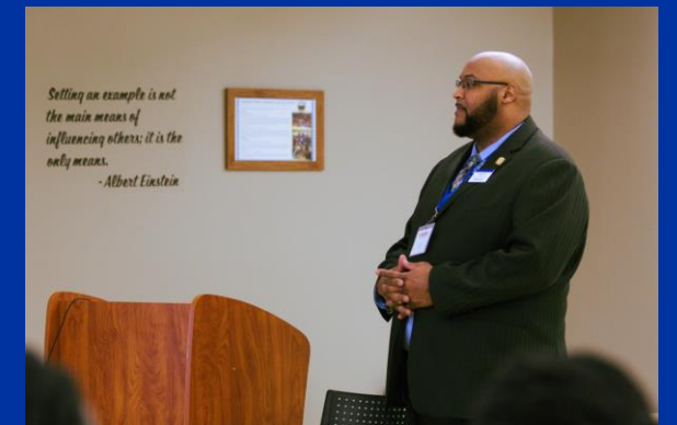
Divine Nine 102 Presentation