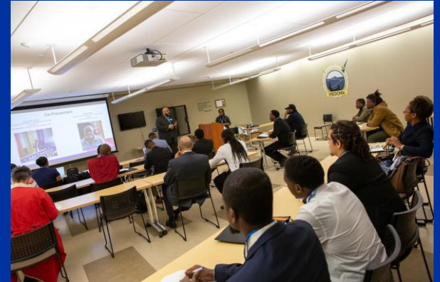
Divine Nine 102 Presentation