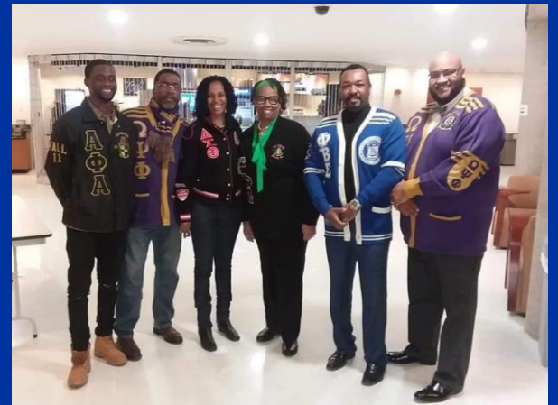
Meet the Greeks Panel Discussion