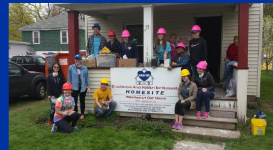
Habitat for Humanity Club Volunteers