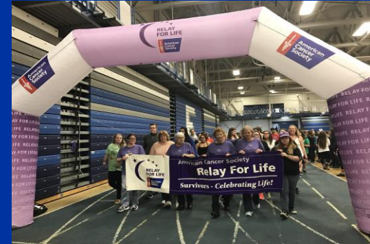
Relay for Life