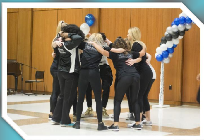
Envied Expression getting the crowd pumped up.