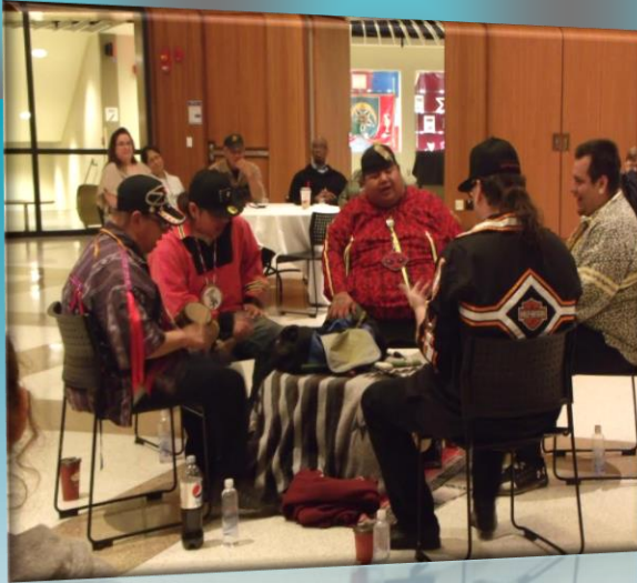
Native American History Month Op theme, “Knowledge of the Past, Wisdom of the Future”. Performance by musical group “Old Bridge”.

Latinos Unidos presents La Fiesta! This year’s theme was a Masquerade Ball.