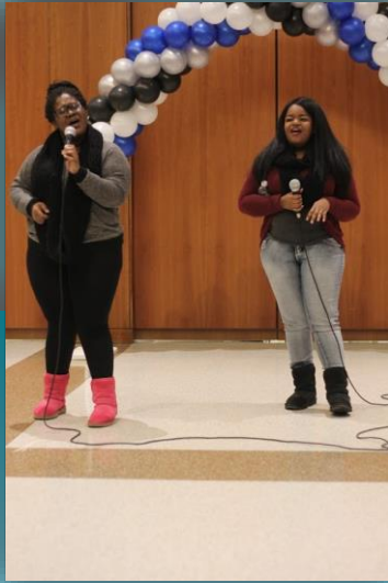
Divine Sound performing at Culturefest. Their SOUND was just, well, DIVINE!