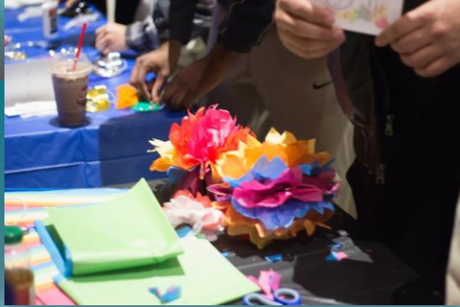
Latinos Unidos' event activity: paper tissue flowers.