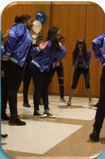
Blue Ice Step Team showing us how talented they are!