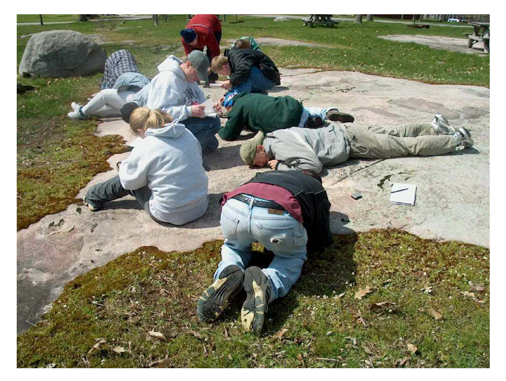
Petrology students studying alaskite (micro leucogranite) exposures at Kring Point State Park, on the St. Lawrence River, 4/2002